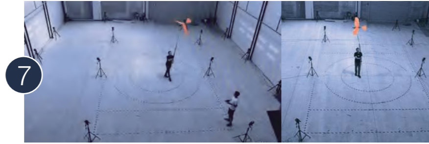
7 Optimizing Flapping-wing Aerial Robot in Super Space by Harbin Institute of Technology