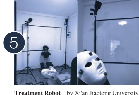
5 Treatment Robot by Xi'an Jiaotong University