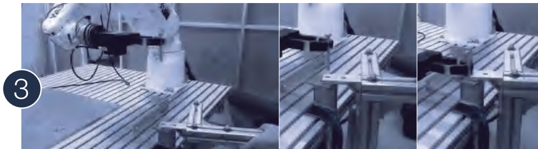
3 Optimization of Robotic Arm Control by Wuhan University