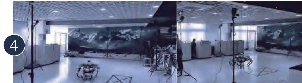
4 Optimization of Hexapod Robot Algorithm by Shanghai Jiaotong University