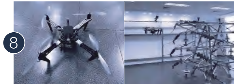
8 Inspection of Power Tower by China Electric Power Research Institute (CEPRI)