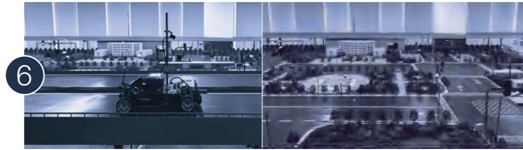
6 UGV Direction Control by China Automotive Technology & Research Center (CATARC)