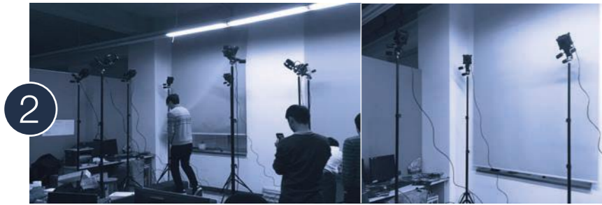
2 Supports with Exoskeleton Robots Design by Beihang University